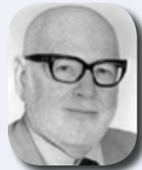
Thomas Sebeok (1920–2001)

was a Baltic German philosopher and biologist, and an alumnus of the University of Tartu, whose work is nowadays included among the major classics of semiotics. One of his most important books regarding semiotics is The Theory of Meaning (1940).