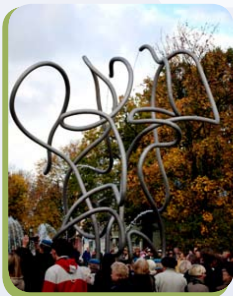
Statue of Juri Lotman in Tartu in front of the University Library.