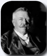
Jakob von Uexküll (1864–1944)

Lotman was a modest, immensely cultured man and a meticulous technician who was also an improviser of unusual verbal seductiveness and a tireless generator of new ideas, who foregrounded and in this sense prefigured the dynamics of cultural facts.